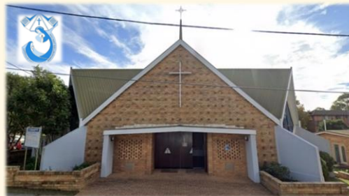
Deanery 8 (St George)