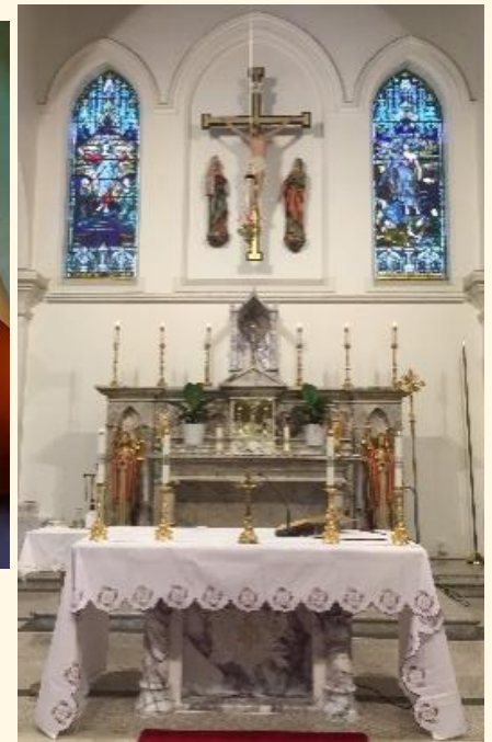
St Patrick Kogarah