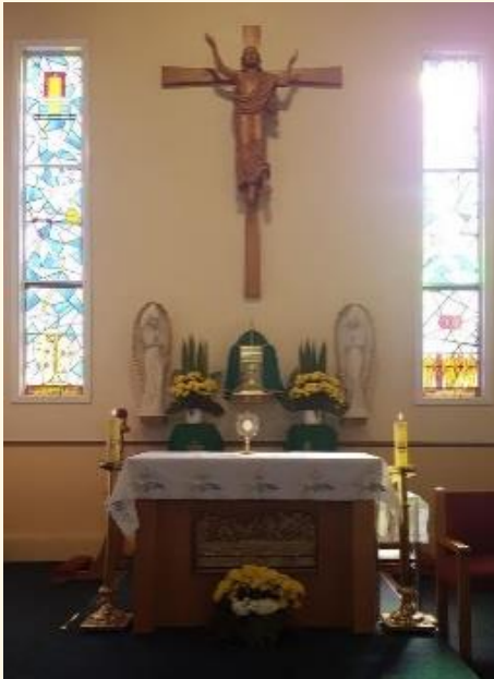
St Michael Hurstville

St Michael Hurstville, St Bernadette Carlton, St Patrick Kogarah