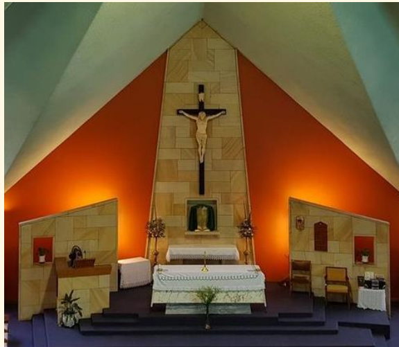
St Bernadette Carlton